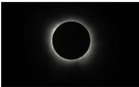
Totality during the total solar eclipse. Waco, Texas, April 8, 2024.