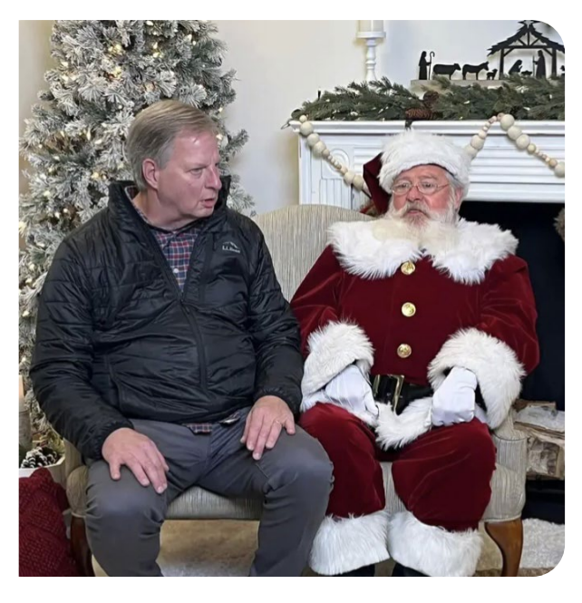
What do you think these two are talking about?