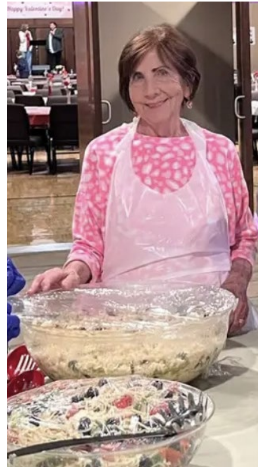
"I do it because I love it."